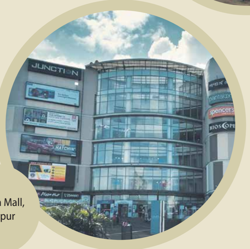
Junction Mall, Durgapur