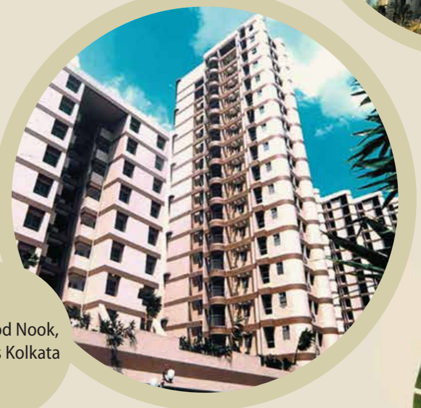
Greenwood Nook, EM Bypass Kolkata