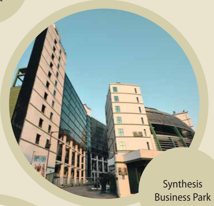
Synthesis Business Park