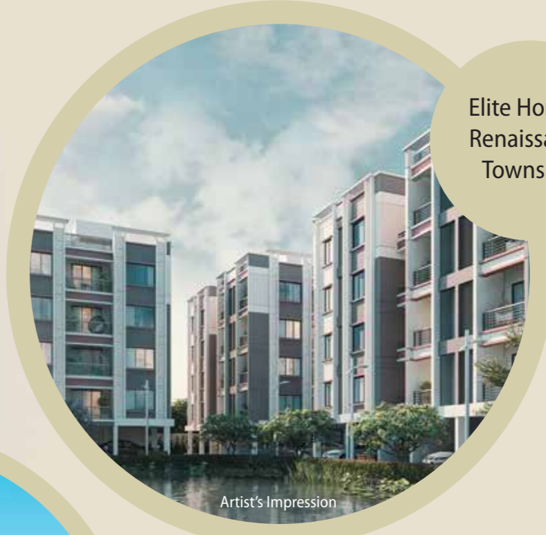
Elite Homes, Renaissance Township