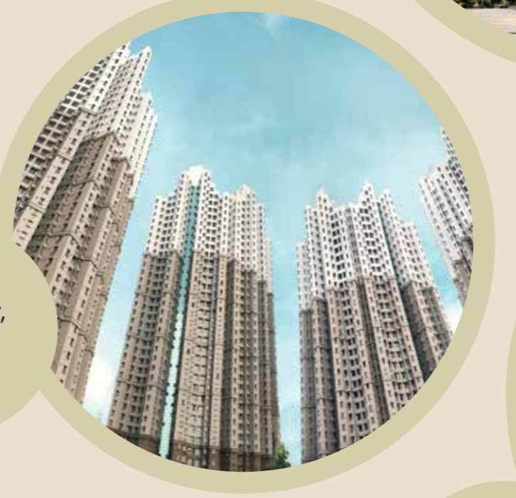
South City, Kolkata