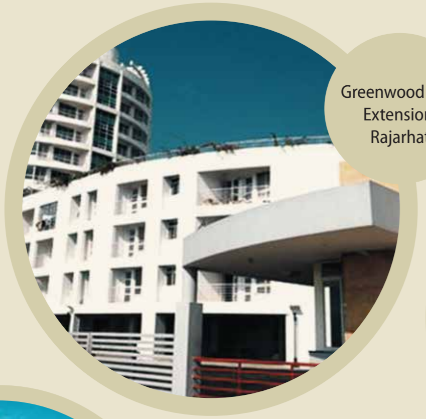
Greenwood Park Extension, Rajarhat