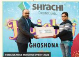
RENAISSANCE HOICHOI EVENT 2022