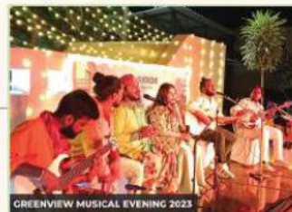
GREENVIEW MUSICAL EVENING 2023