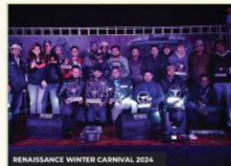
RENAISSANCE WINTER CARNIVAL 2024