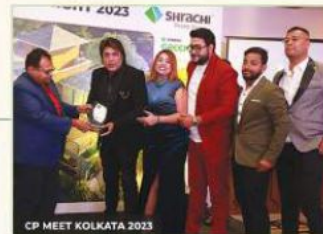
CP MEET KOLKATA 2023