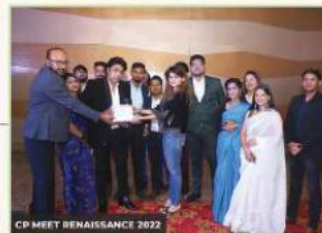
CP MEET RENAISSANCE 2022