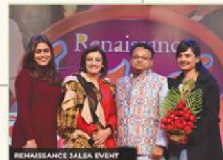
RENAISSANCE JALSA EVENT