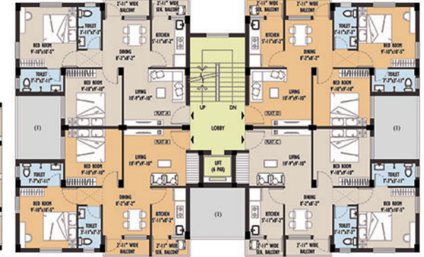
Typical Floor (1st-4th Floor)