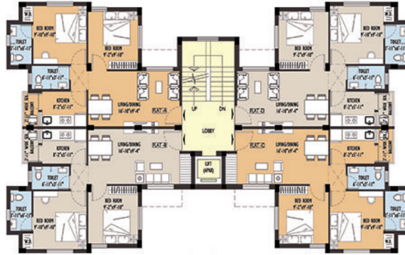
First & Second Floor