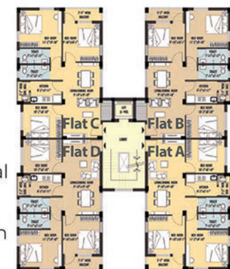
Typical Floor 1st-4th Floor