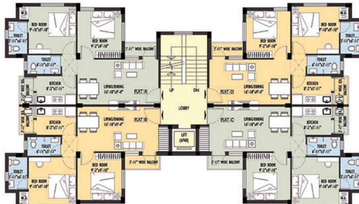
Third Floor 3rd-4th Floor